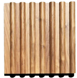
TAMBOUR A1 WALNUT