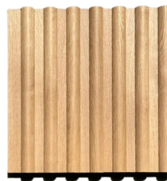
TAMBOUR A1 OAK