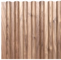
EASTERN BLACK WALNUT