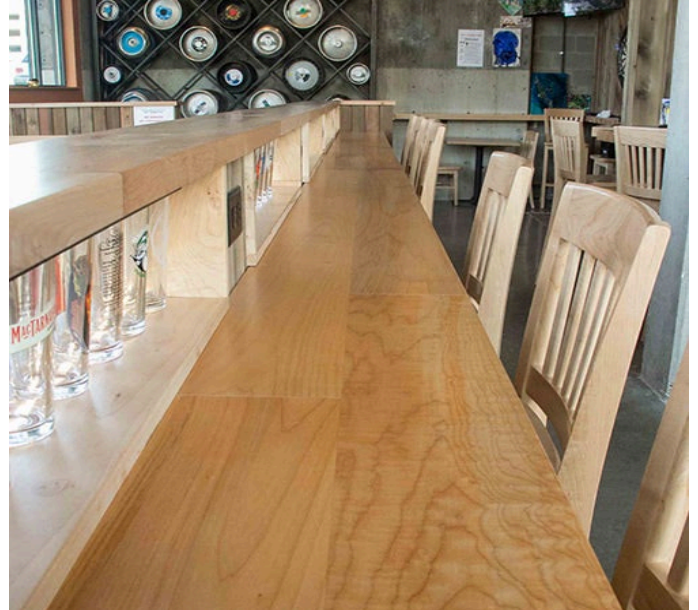
Western Maple Plank Countertop | Watershed Pub + Kitchen, Seattle, WA

Available in Class A or Class B upon request