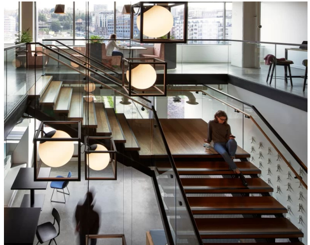
White Oak_Treads + Landings | Confidential Tech Client, Seattle, WA

Available in Class A or Class B upon request